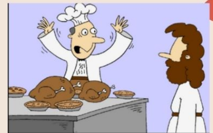
(See Matthew 14:14-21) 11-24-19 HONESTLY JESUS, YOU GIVE ME 5 PIES AND 2 TURKEYS AND EXPECT ME TO COOK FOR THE 5,000 GUESTS YOU'VE INVITED???